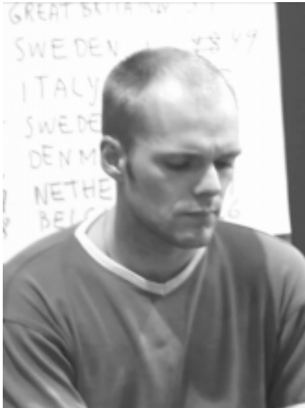
Sigsgaard - also made 6 hearts